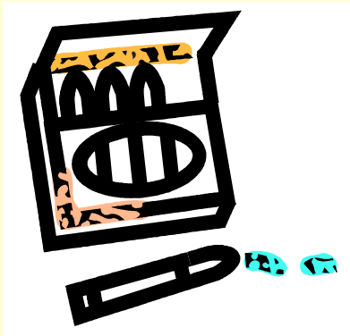
Fall 2010 GRO Student Projects.

The PGT awards one $500 scholarship every year to a graduating senior from each high school.