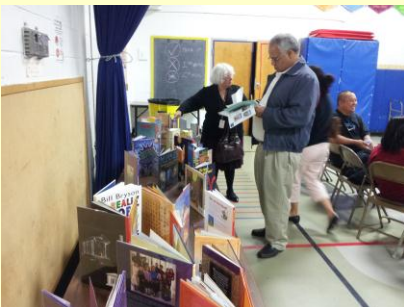
GRO Back to School Night (Oct 12, 2011) - Children's books from the Parsippany Public Library on display.

http://www.pthsd.k12.nj.us/PGT/index.htm