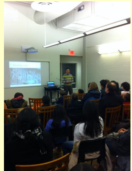
Shen Yun Performing Arts presentation (Jan 5, 2012)